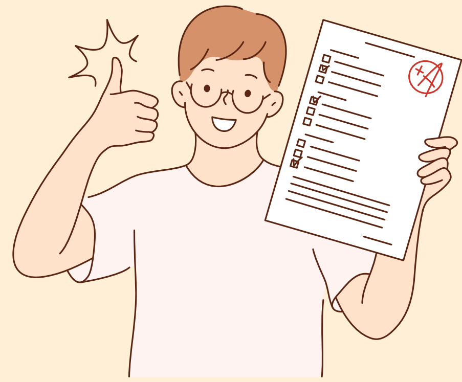
Prepare for Exams